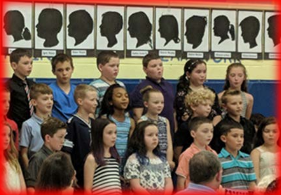
AES Grade Four Celebration