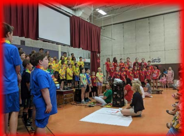
CES Grade Four Celebration