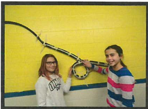
Girls making a roller coaster during the STEAM summer program

*Please contact Danielle for more information*