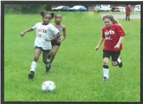
Girls playing soccer during the Sporting Chance program